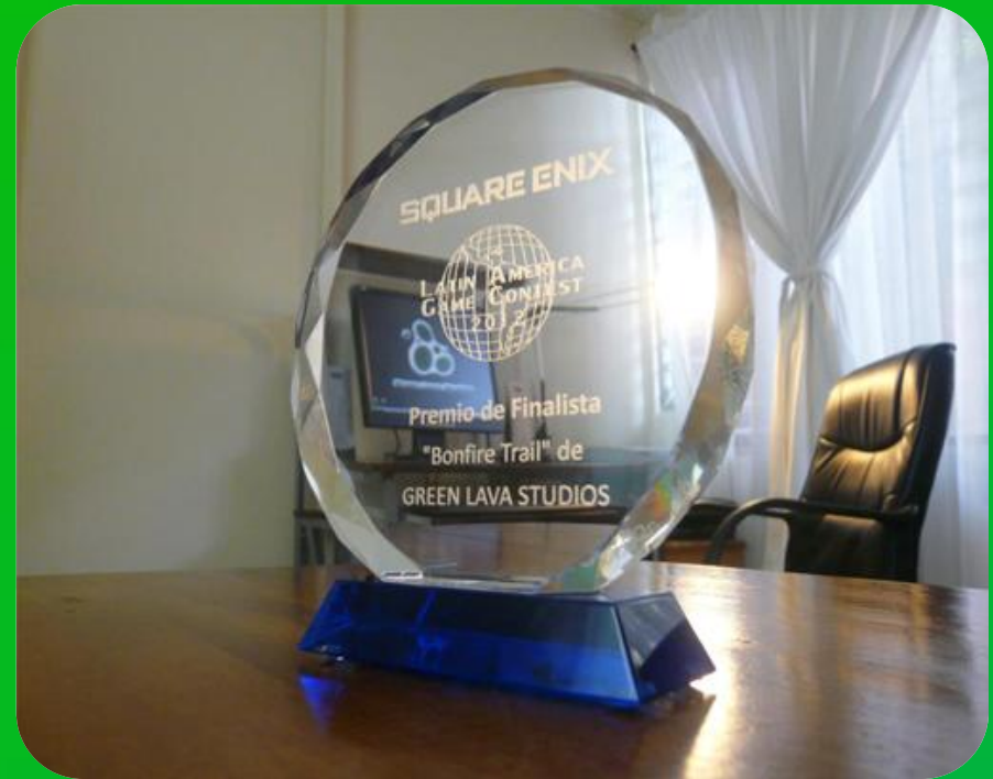
Latin America Game Contest (3rd) Bonfire Trail