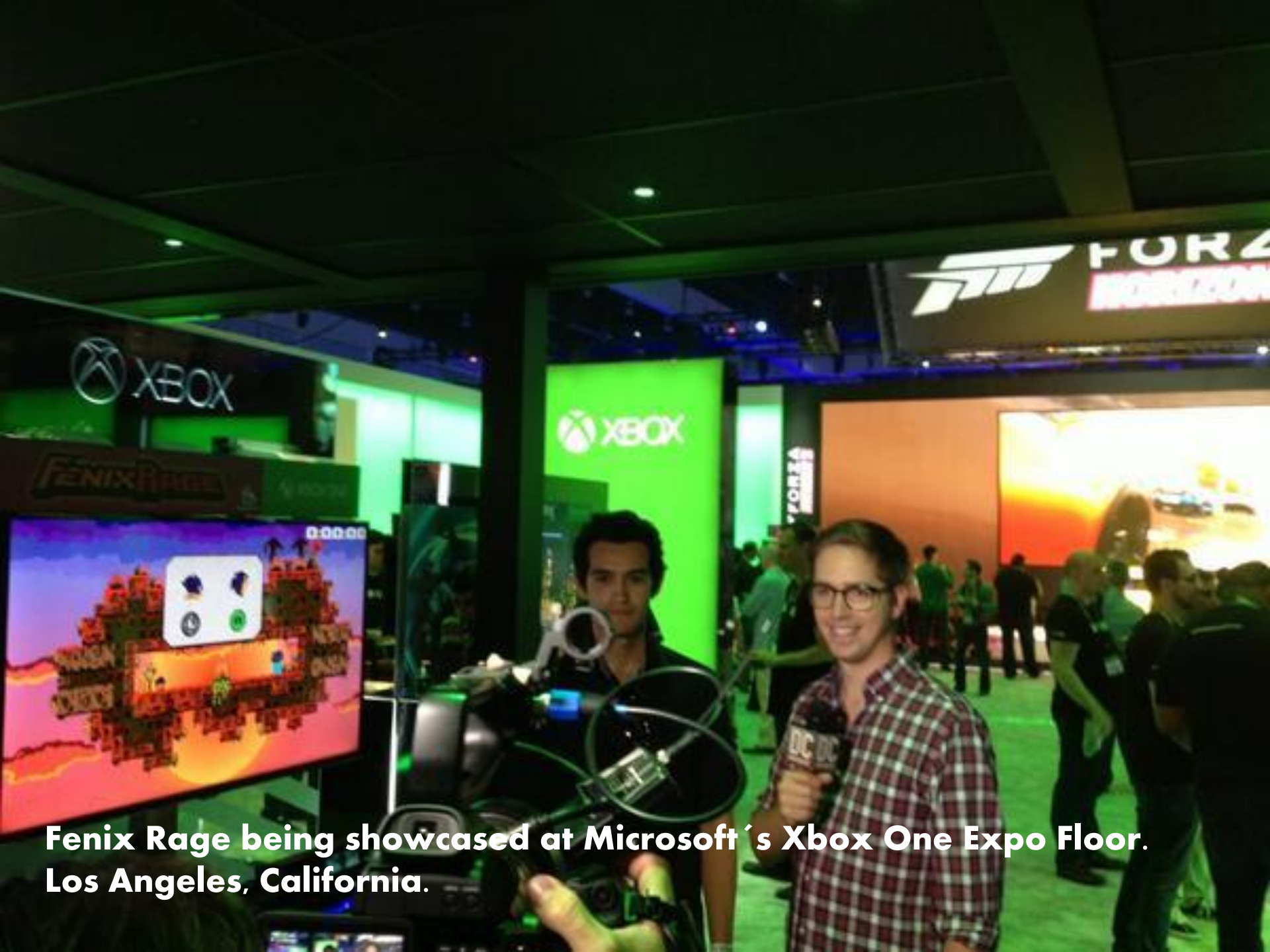
Fenix Rage being showcased at Microsoft's Xbox One Expo Floor. Los Angeles, California.