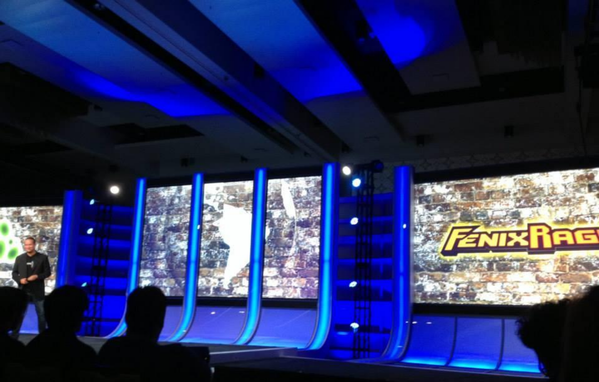
Green Lava Studios being introduced at Sony E3's Press Conference. Los Angeles, California.