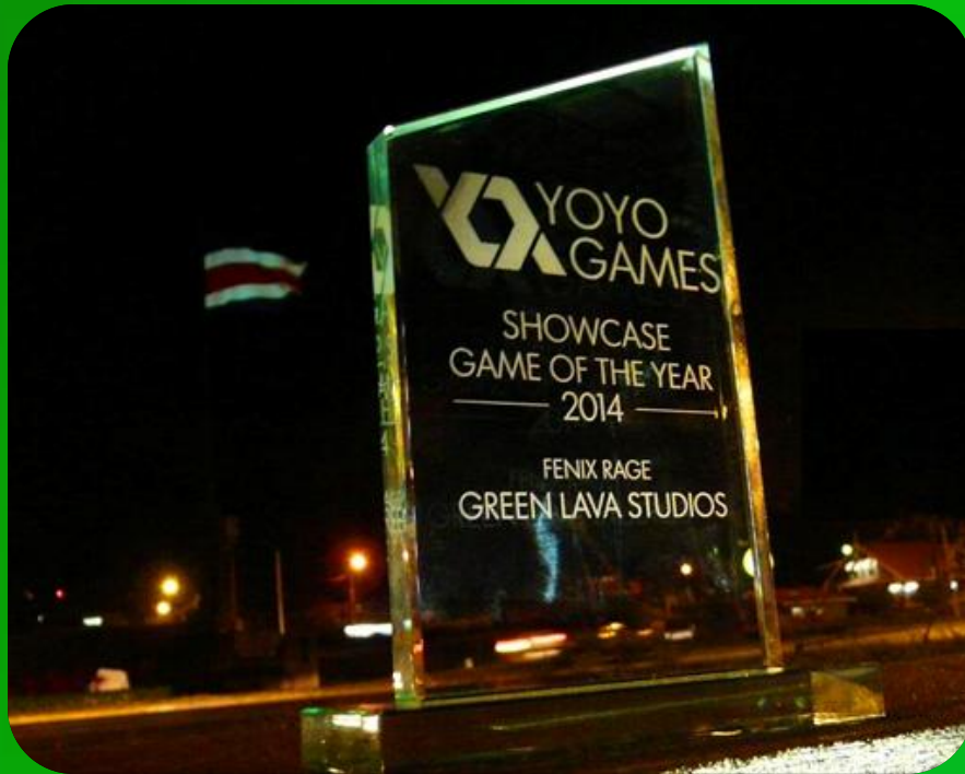
GameMaker Game of the Year. Fenix Rage